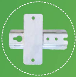
● 型号: ETE-002 Model